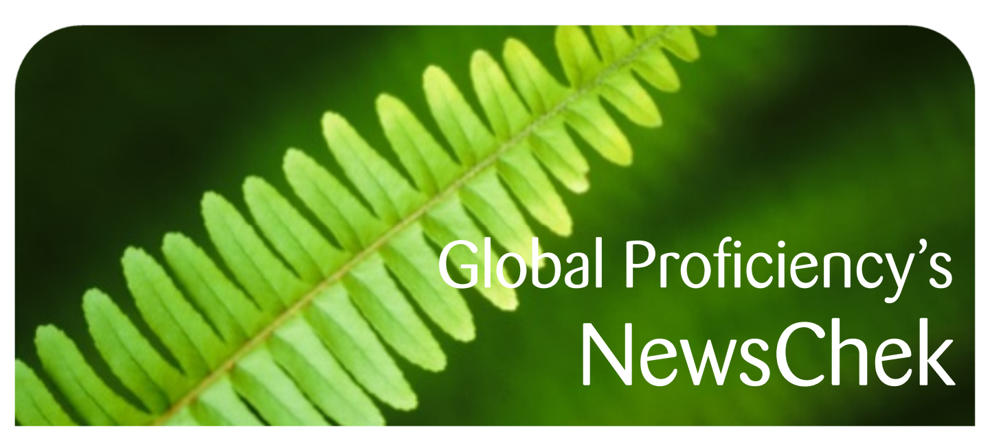
Issue 13, August 2021